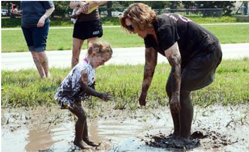
Creating wonderful childhood memories